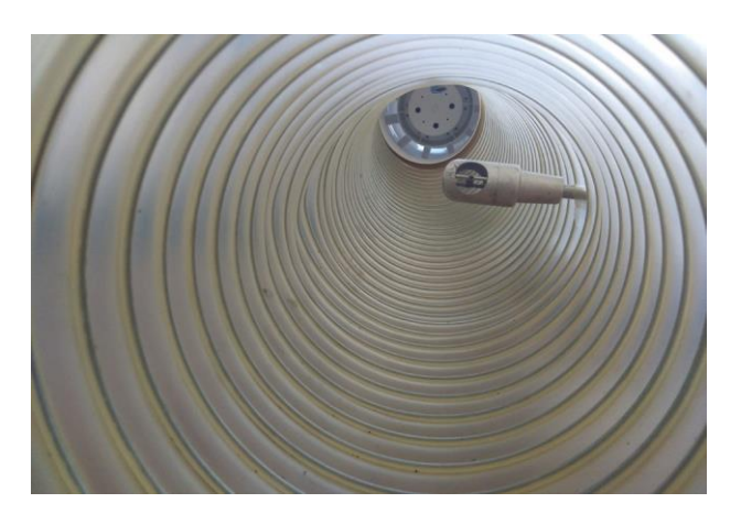
Anemometer in duct