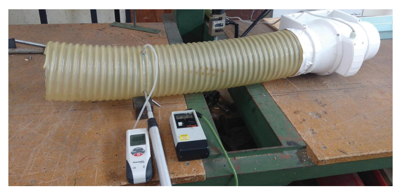
Ducting, fan, manometer and anemometer

Ducting was connected to a fan; each vent type was then installed at the end of the duct. The volume of air passing through the open ducting and the various vents was measured.