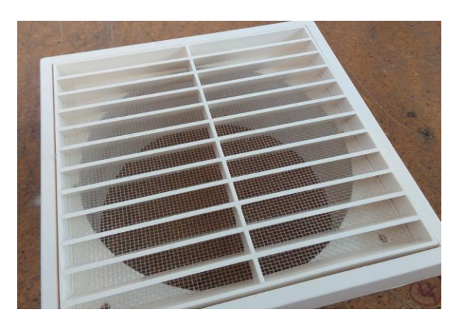
Sofit Vent - Angle Grilled Insect Mesh