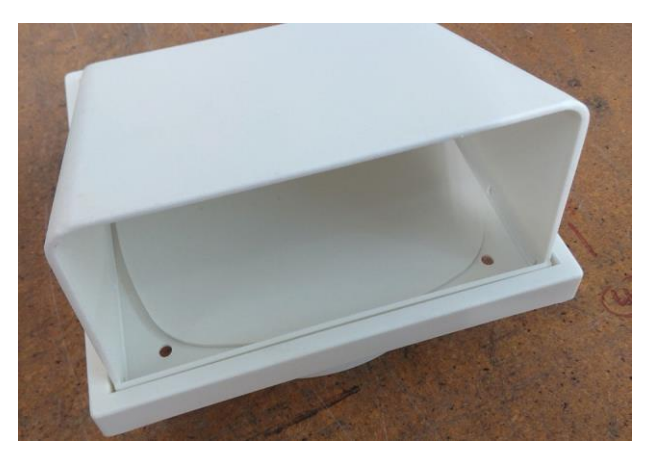
Wall - Cowl Vent - Flap