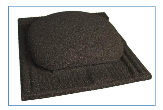
Gerard Roofs - LV 200 series vent - Stratos